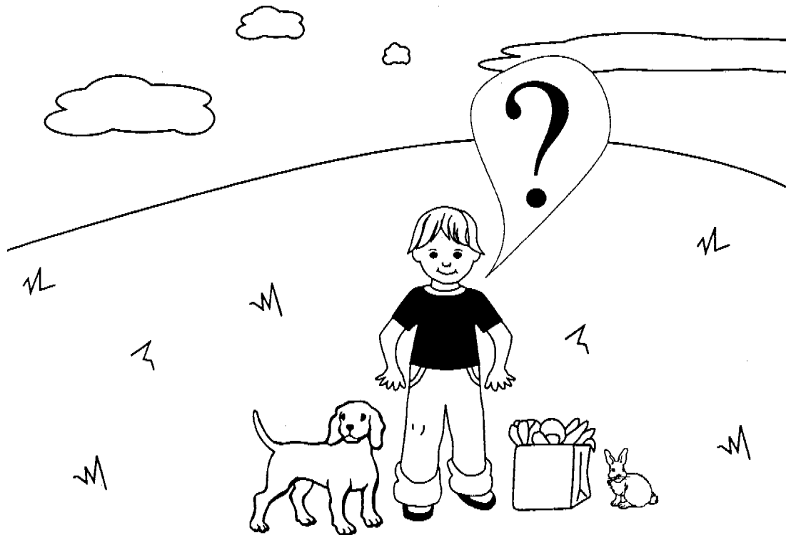
Figure 1.7 Logic Lure (Scene)